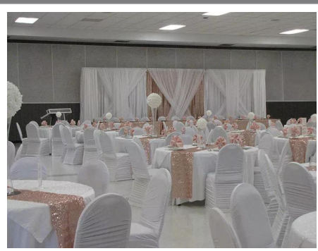
Prince Albert's Finest Multi-Function Facility

Meetings-Trade Shows-Conventions Concerts-Reunions-Seminars-Weddings-Livestock shows & Sales